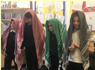
Pupils in Saudi Arabian dress as part of our Gender Equality Topic.